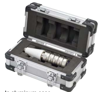
In aluminum case

1. Can also be used with ANSI/DIN and other international standard spindles.