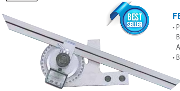
495 Model Net weight 0.62kg