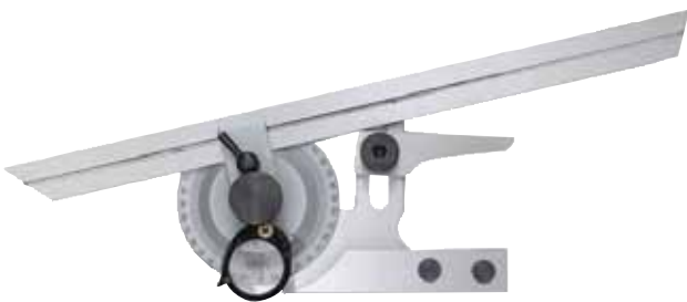
496 Model Net weight 0.51kg